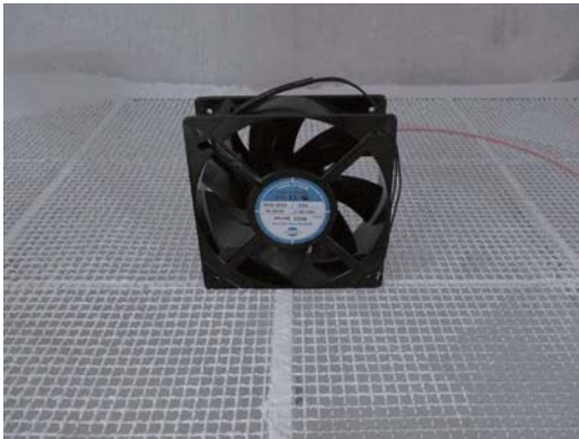
1-1 IP6X Before Test