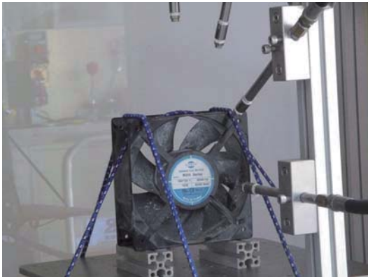
2-1 IPX9K Before Test